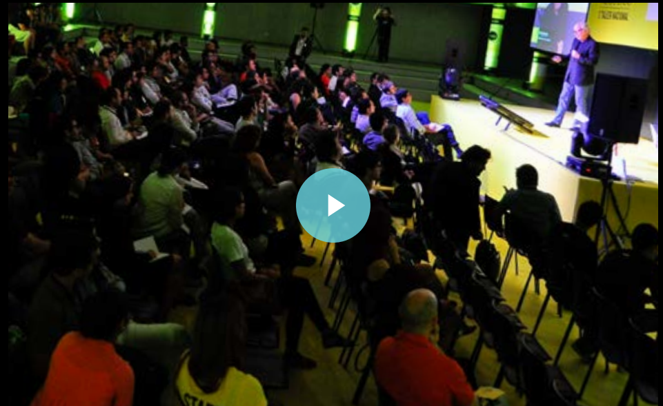
Dien Diseno, Santiago Chile