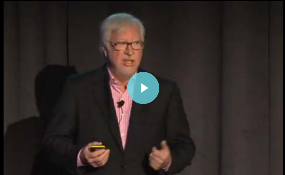
Better By Design CEO Summit, New Zealand