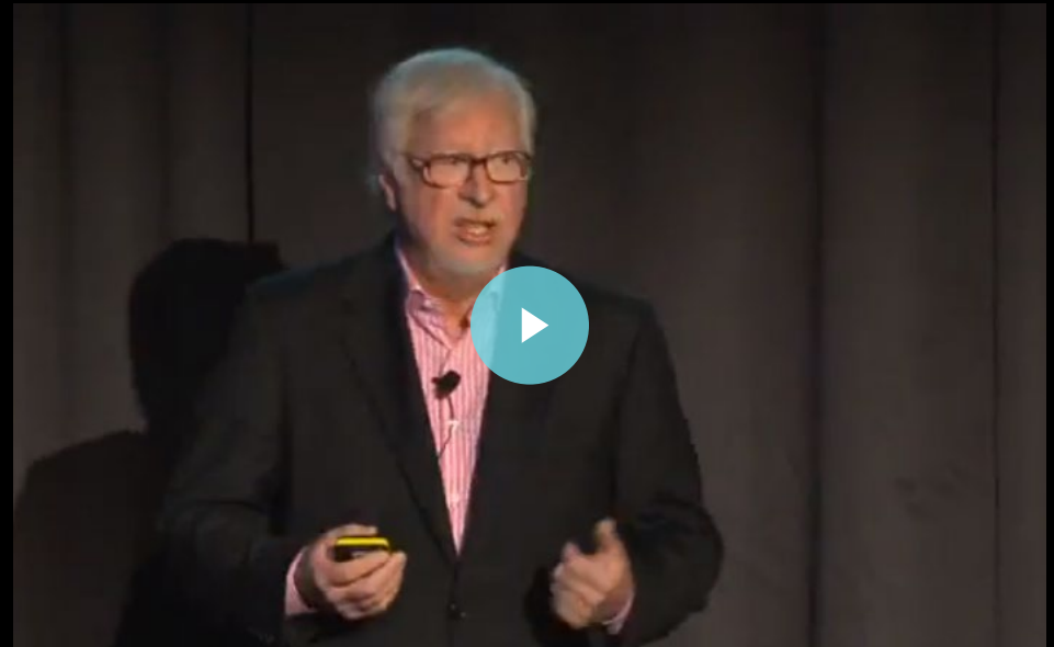
Better By Design CEO Summit, New Zealand