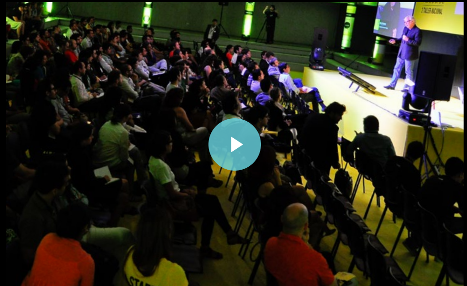
Dien Diseno, Santiago Chile